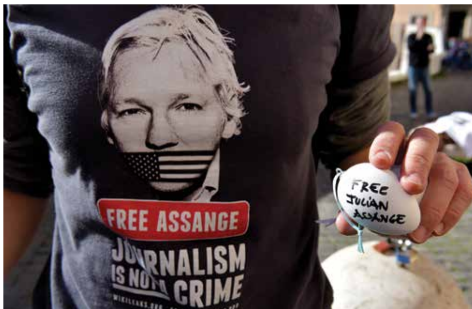
People protest with t-shirts and Easter eggs at Largo di Torre Argentina in Rome April 11.

This decision is unsurprising—it has been obvious for years that the United States and UK are determined to destroy