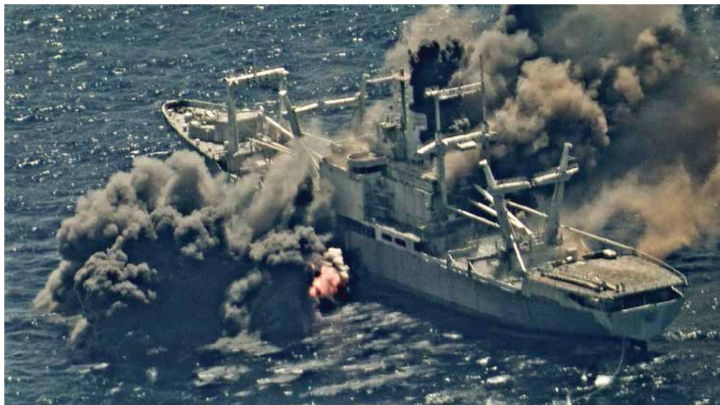
The USS Durham is sunk by missiles off of Hawaii as part of RIMPAC naval exercise.

The petition rejects "the massive expenditure of funds on warmaking when