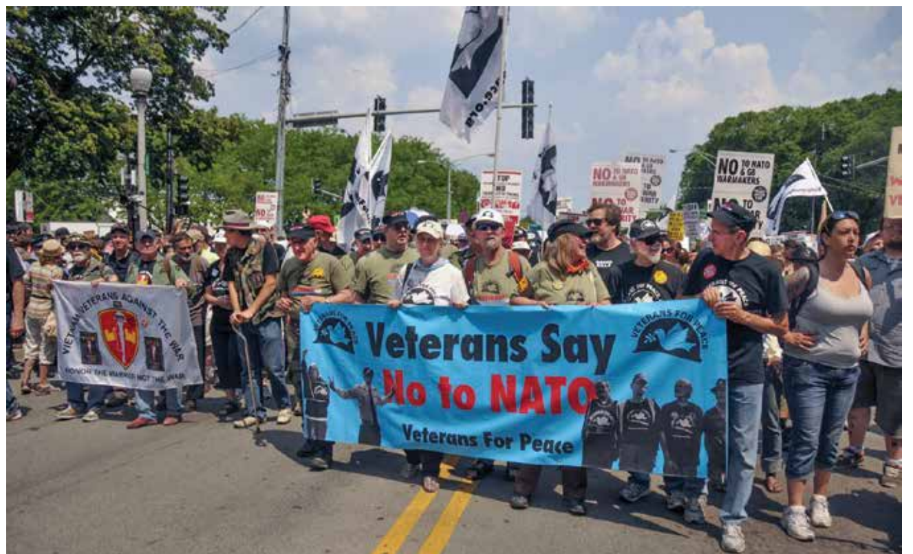
Veterans take part in the protest at NATO's 2012 summit in Chicago.