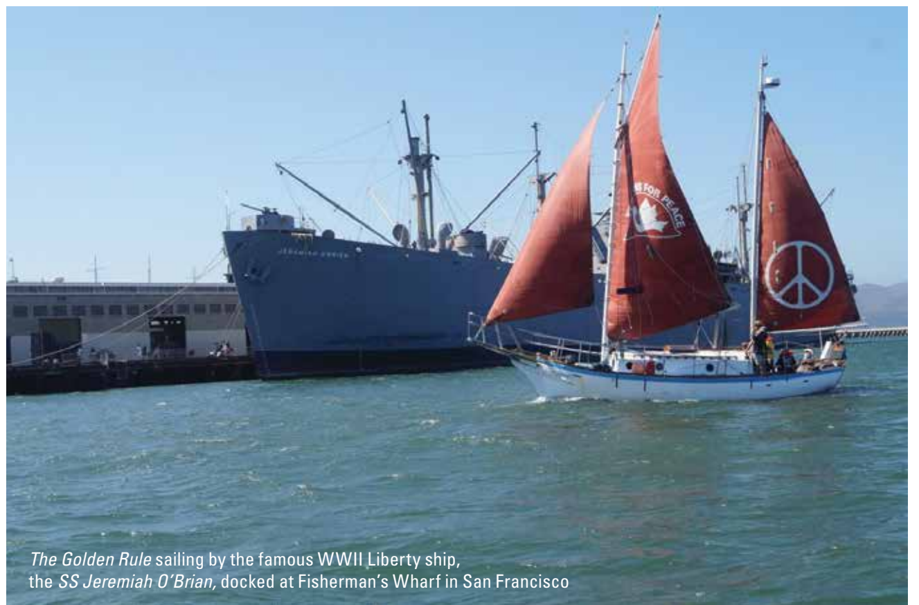
The Golden Rule sailing by the famous WWII Liberty ship, the SS Jeremiah O'Brian, docked at Fisherman's Wharf in San Francisco

The trailer is out for the new documentary Golden Rule: The Journey for Peace; view the trailer at redford-center.org/films/the-golden-rule .