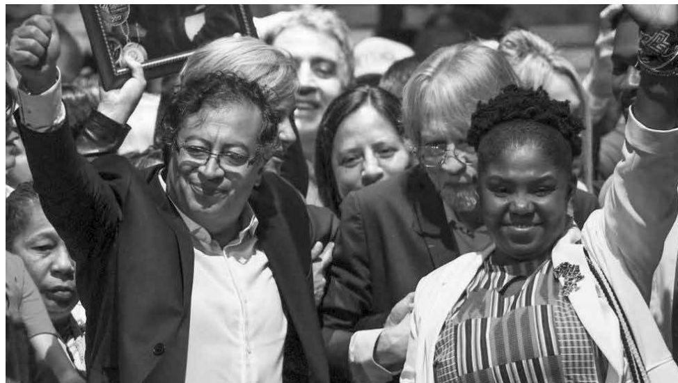
Gustavo Petro and Francia Márquez: A new era for Colombia - BBC News