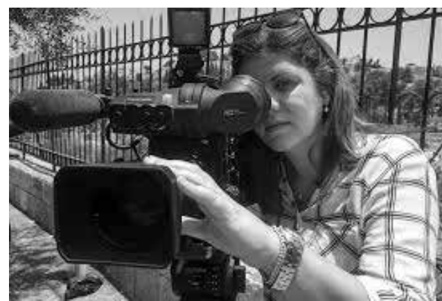
Shireen Abu Akleh

"Now, the occupying power has spoken back by shooting her in the head and attacking her mourners — a response that can only be classified as acute and multiterred state savagery, in keeping with Israel's modus operandi