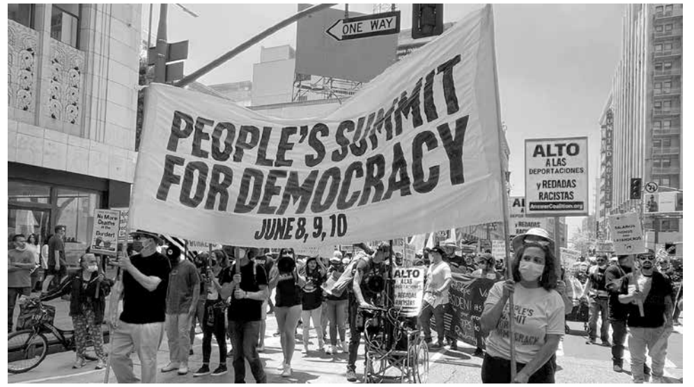
March from People's Summit to Summit of the Americas.