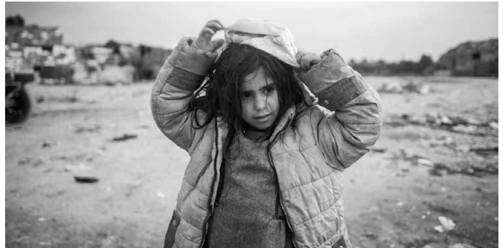
A Palestinian girl outside her family home during a cold spell in a slum on the outskirts of the Khan Younis refugee camp, southern Gaza Strip, Jan. 19, 2022.

Might be just to prove some tasks ain't meant to be neatly played out on paper and into air, but rather should tear out from lung, heart and brain with a flair of flicked wrists and sly smile above the 88s ... and, of course, that ever-human weight of pride that swallows us when a thing's done just right ... But they were eager to prove me wrong. They chose their fastest machine with their trickiest song and stuck it in a room far down the hall from me. They didn't know how sharp I can see with these ears of mine—I caught every note even though they played it in triple time. And when I played it back to them even faster, I could feel the violent stares ... heard one mutter Lucky black bastard ... and that was my cue to rise, to take a bow in their smoldering silence and say, Not luck, my friend, but the science of touch and sweat and stubborn old toil. I'd bet these ten fingers against any coil of wire and parchment and pump. And I left them there to ponder the wonders of blindness as I walked out the door into the heat of the sun.