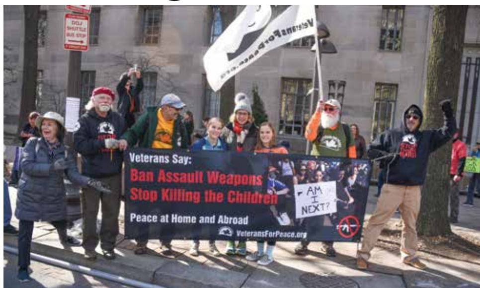
Veterans For Peace at the March for Our Lives, March 24, 2018.

As of 2020 guns became the leading cause of death among people ages 1 to 19 in the United States, according to the Gun Violence Archive, which has documented