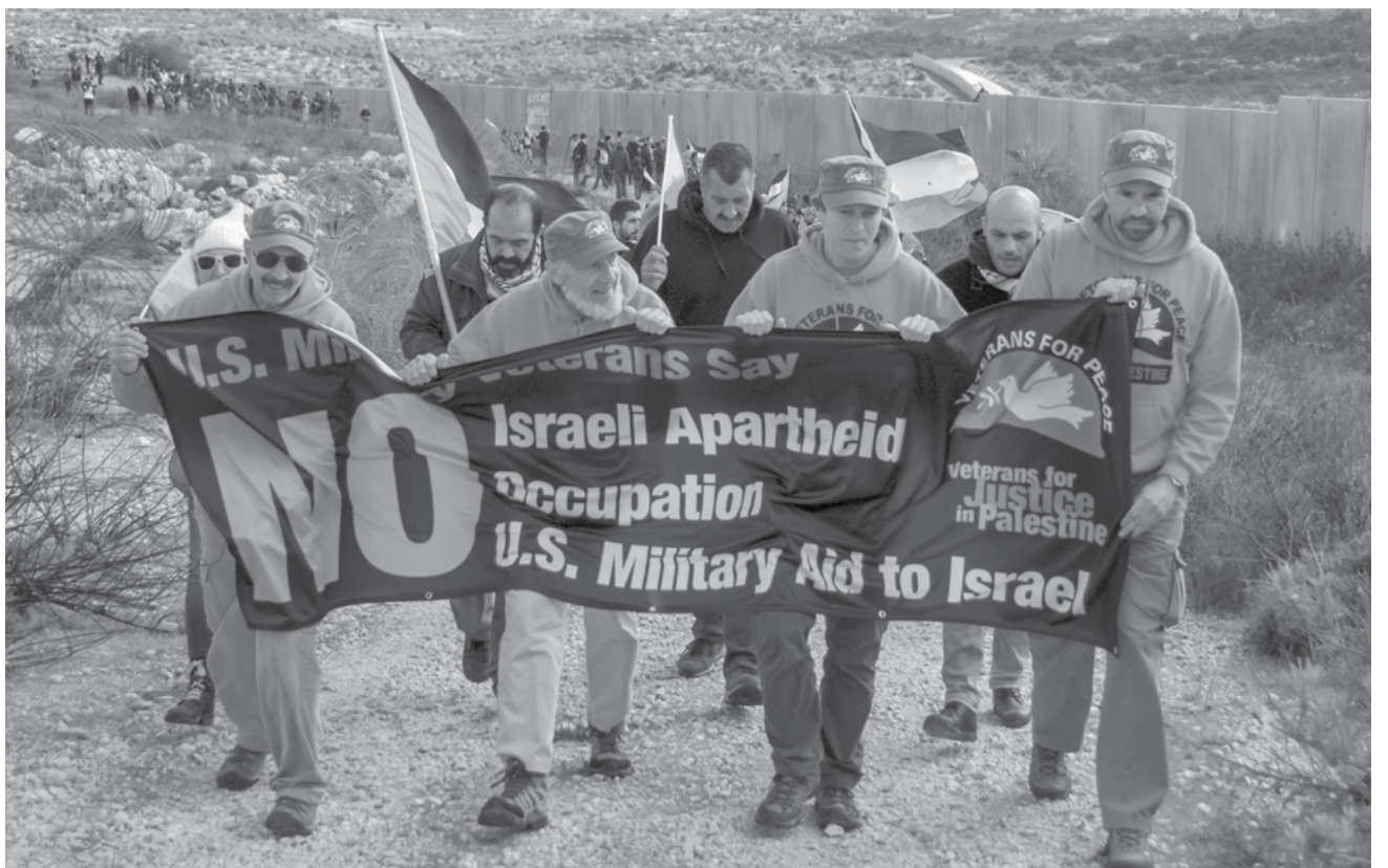
Veterans For Peace at a demonstration in Bil'in, Palestine.

In the furor that exists in the U.S. today about BDS and the right and wrong of a cultural boycott of Israel, a