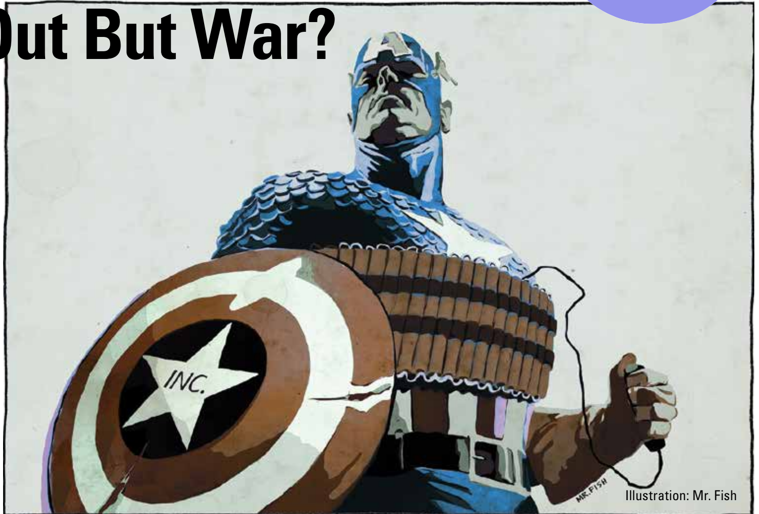
Illustration: Mr. Fish