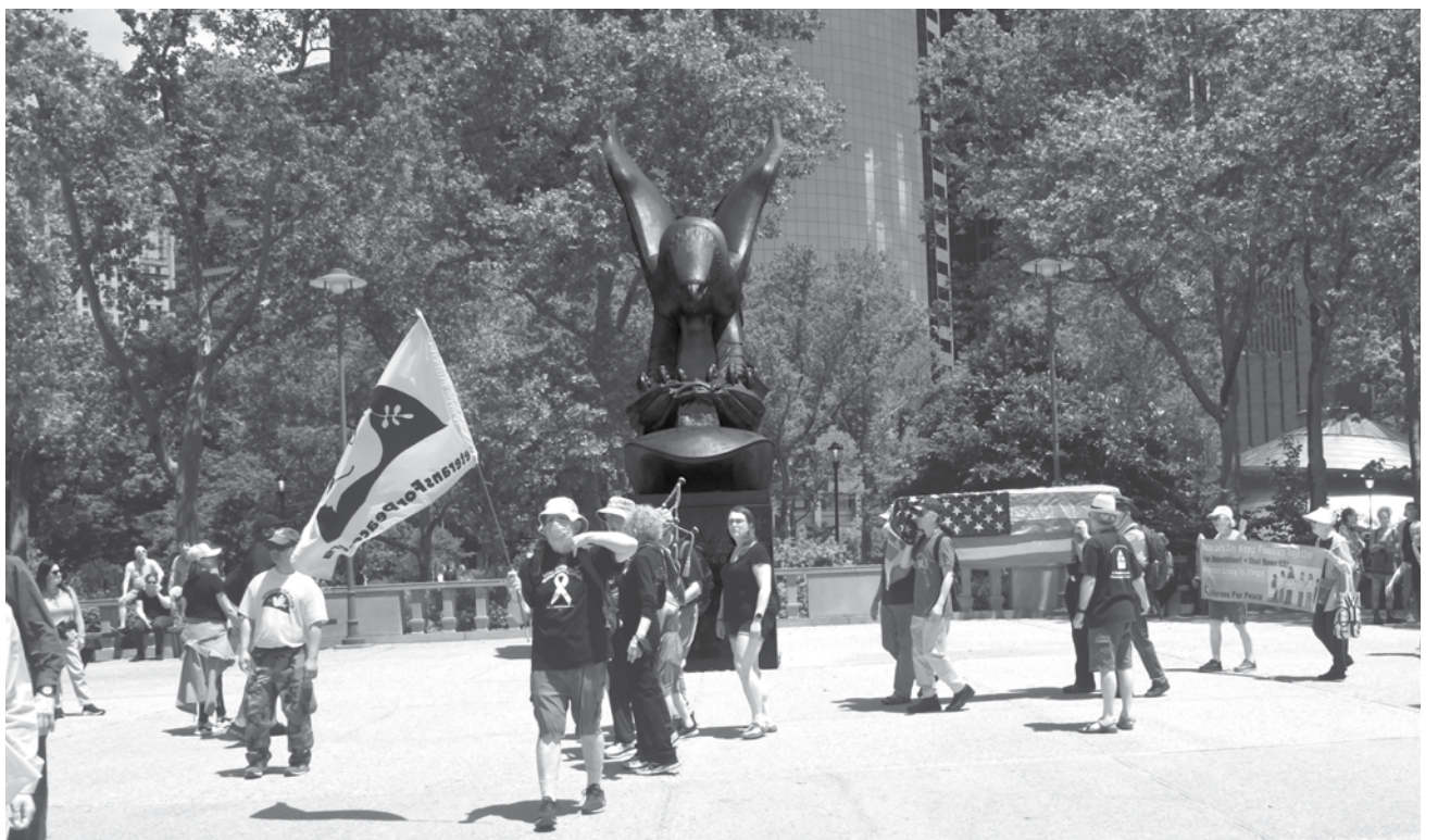
New York City Veterans For Peace commemorated Memorial Day with a solemn procession remembering all those killed in war; the dove of the VFP flag was in marked contrast to the diving eagle at the center of the East Coast Memorial honoring American servicemembers killed in the Atlantic in World War II.

their children to gun and police violence, I still rationalized the brutality of war as somehow different and more acceptable than violence at home. Clarity began in 2001 when the United States invaded Afghanistan and Iraq. First, I met military families with loved ones deployed and Gold Star families who lost a family member serving in the U.S. military. In 2003 I traveled to Iraq to observe the U.S. occupation firsthand and met Iraqis with family members killed by U.S. troops. I observed how their pain and the pain of the Gold Star families were the same. The depth of loss for both was nearly unbearable. I met service members who returned home, but their buddies died in Iraq and Afghanistan. I watched tough